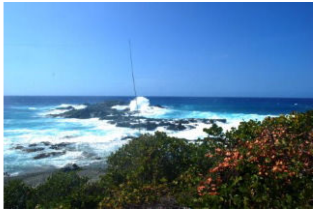
Looking west toward the Dominican Republic