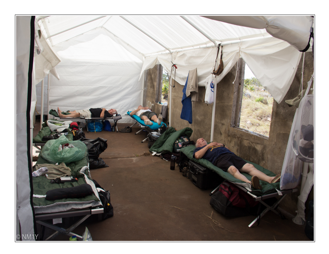
Inside one of our two shelters inside the keeper's house. We operated until we dropped.

It was also required, like on Desecheo, that three USFWS Law Enforcement officers accompany us not just to protect us from any possible threats (illegal aliens, drug trafficers, etc) but to insure we abide by all of the specifics in the SUP. We were allowed 15 people for 14 days total. Besides requiring helicopter landing (for safety) we were also required to supply a stand-by support vessel for any possible emergency or evacuation. USFWS would also have three biologists on the island doing survey work. Also, in writing, it was made very clear that USFWS would not consider another SUP application for "at least" ten more years. This made the opportunity a once in a 32-year period opportunity. We had to be successful!