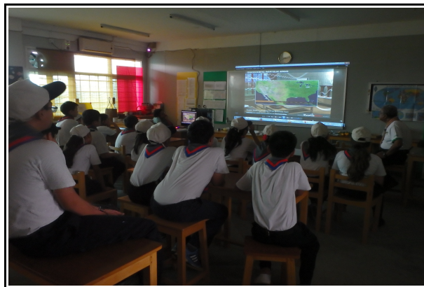
The scouts watching the 19min video “An Introduction to Amateur Radio” - K1AN Narrating