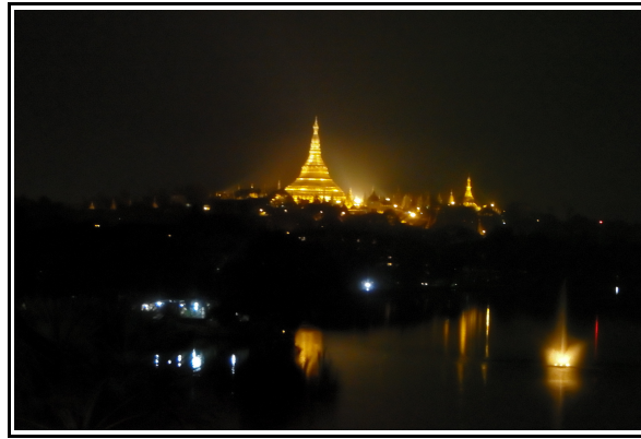
The most prominent structure in Yangon: The Shwe Dagon Pagoda